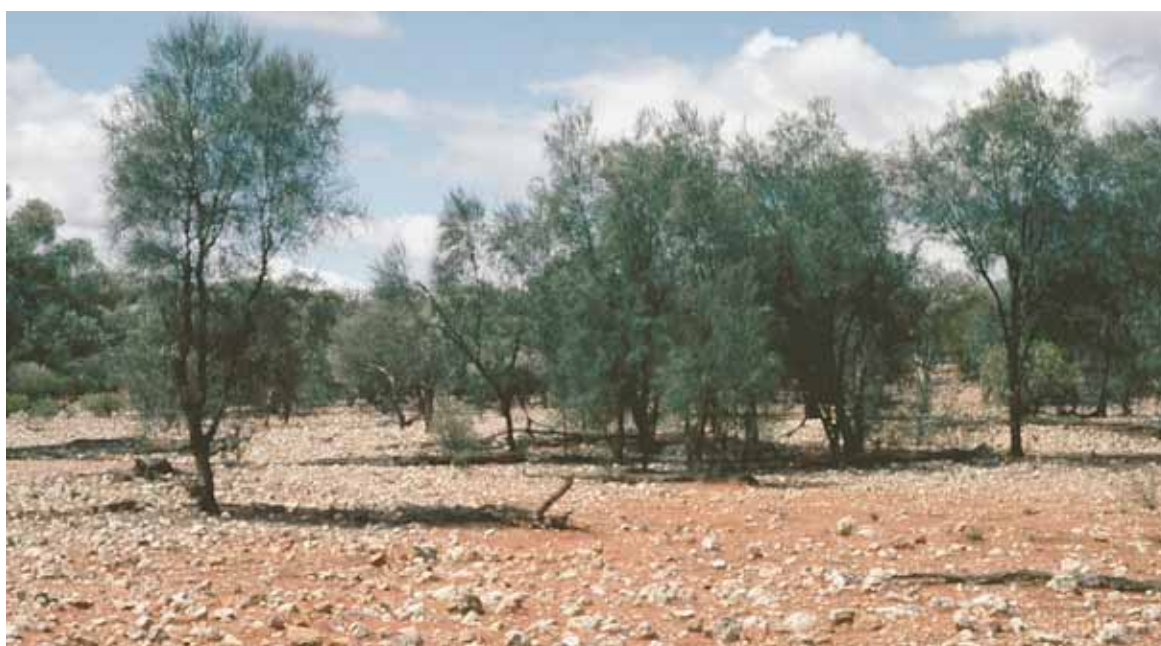
Casuarina cristata spp. pauper woodland, Carrawinya National Park, Qld