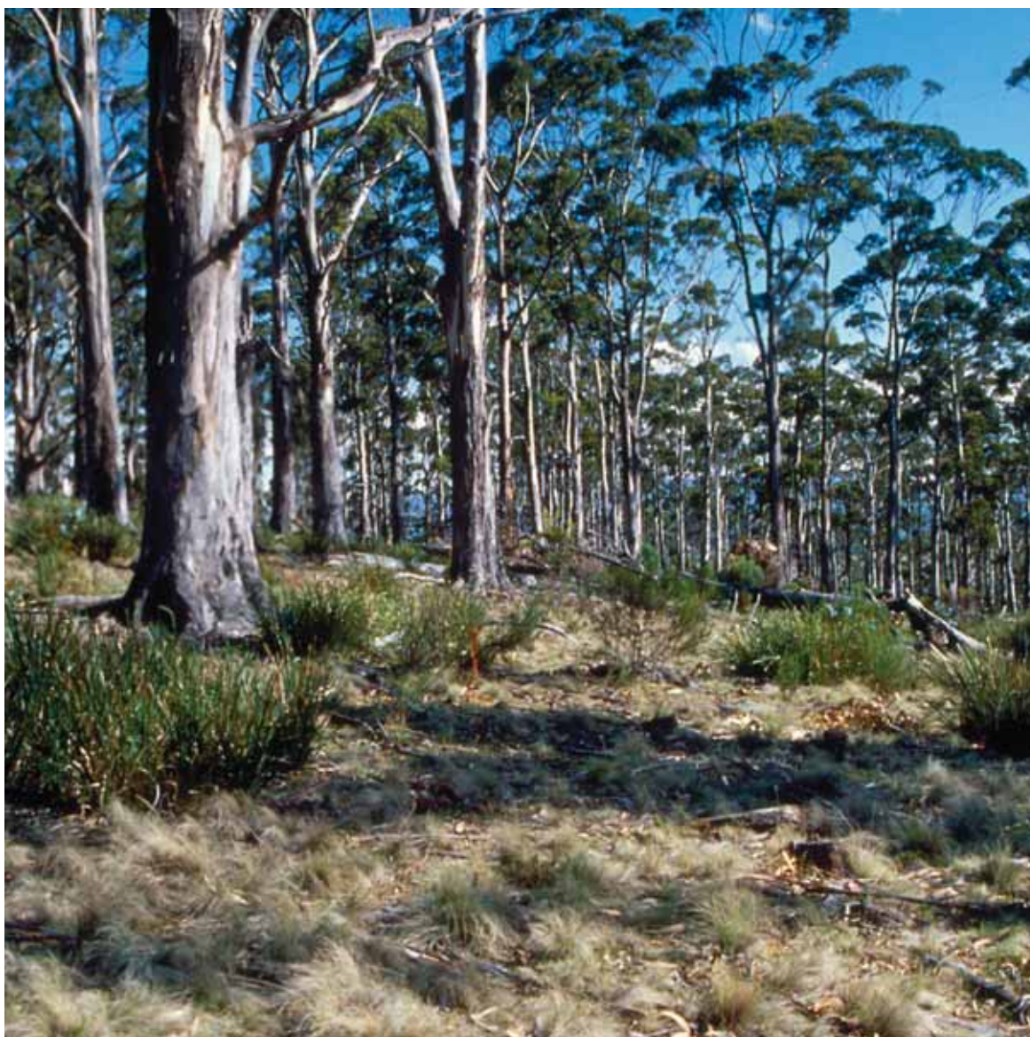
Eucalyptus globulus (blue gum) grassy forest, Bangor, Forestier Peninsula, Tas