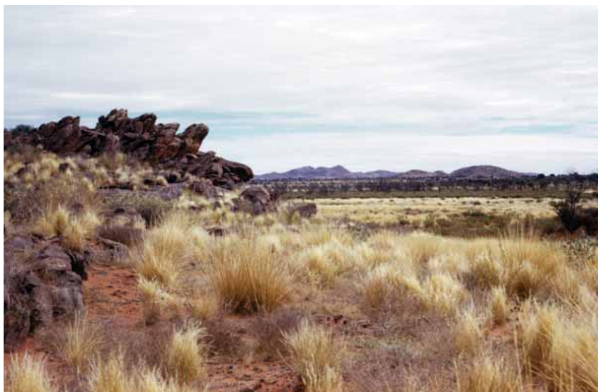
Ehrenberg Range, WA